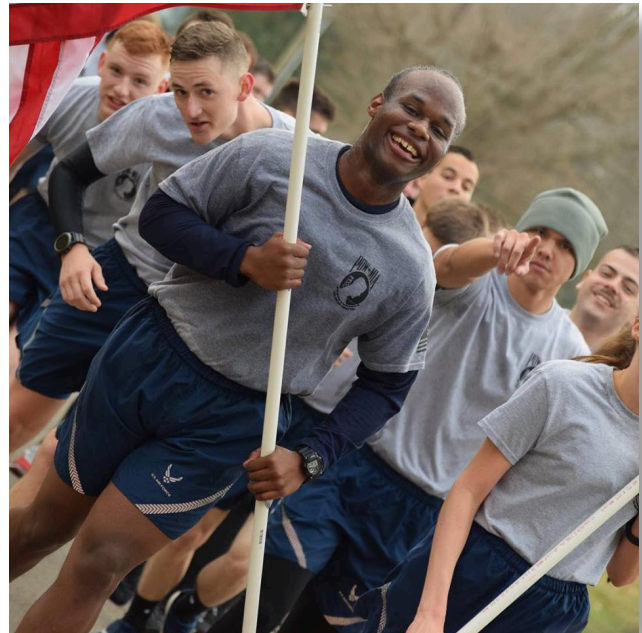
Physical fitness is an important part of Air Force ROTC. Det 290 cadets workout together twice weekly, and we encourage additional individual fitness sessions.

If you do not think that you can pass our PFA right now that does not mean you cannot join AFROTC. Our PT sessions will help, but you will definitely need to work hard over the course of the semester to continue to improve in whatever areas you need to in order to pass. That will probably require some additional gym time lifting weights, running practice on your own, and better nutrition...or perhaps all three. You need to be ready to work hard on these areas, and be realistic with yourself about being able to meet our physical training requirements.