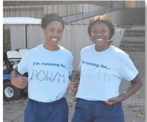
Our cadets participate in community service projects, campus programs and athletic events, food drives, animal shelter events, and many other opportunities around the Lexington, KY area!

You will receive real-world, practical experience managing projects, arranging meetings, setting deadlines, coordinating with other cadets, and conducting training operations in our program. These skills are invaluable and will help set you apart from other students whether you complete Air Force ROTC and join the Air Force, or just try us out for a semester or two.