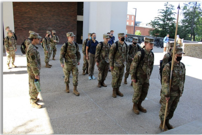
Leadership Lab activities range from marching to expeditionary leadership problems, military customs and courtesies, Field Training preparation, inspections, warrior knowledge tests and lots more.

Class sizes vary, with no more than 25 cadets per class session. Our program emphasizes a lot of the following skill areas / competencies: