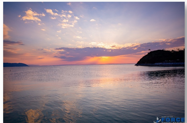
One of our cadre members was recently stationed on Okinawa, Japan. This incredible view was just outside her front door!

Around the world, there are Air Force bases everywhere from Aviano (Italy) to Ramstein (Germany), Kadena (Japan), Andersen (Guam) and plenty more—so if you have ever wanted to travel and live overseas, there are plenty of amazing opportunities in the Air Force to do just that. At the beginning of your senior year in ROTC, you identify (up to) the top six career fields you want to serve in, then the top locations you want to move to. From there, the Air Force will do the best it can to assign you based on where you would like to go, subject to the limitations of the needs of the Air Force (i.e., not everyone gets to go to Hawaii for their first duty assignment). From there, you will probably move every three or four years to a new base.