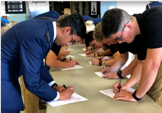
Regular warrior knowledge quizzes will test your ability to memorize and recall information quickly.

Academics is crucial to our program, so you should also strive to be a good student. Our average cadet GPA is 3.26, and our program requires a minimum of a 2.0 GPA just to participate (2.5 GPA for Scholarship cadets). In general, we highly encourage cadets to carry CGPAs of at least 2.75, so if you do not think you will be able to continue your degree program and meet that criteria, you may want to reconsider. You should be at least somewhat physically fit, and ready to continue developing your fitness throughout the entire duration of our program and pass the PFA each semester.