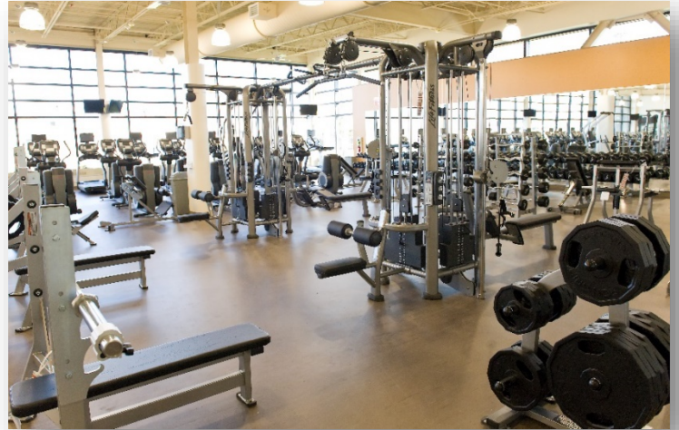
Dover AFB (Delaware) just got an $11,000,000 fitness center upgrade. Fitness facilities at Air Force bases are free of charge to service members and their families.

In terms of lifestyle, the Air Force spends a lot of money making its bases nice places to live and work, and more than any other branch, our bases have phenomenal resources to help you get the most out of your service— wherever you may be. Air Force bases are like small cities attached to an airport...they often have everything from their own schools and housing to fire and police departments , malls , convenience stores and more. From recreational facilities like gyms , bowling centers , golf courses and swimming pools to recreation centers and hospitals , you can pretty much find anything you might need on base. If you doing fun things outside, you will love MWR . Air Force bases even have child care facilities and education centers .