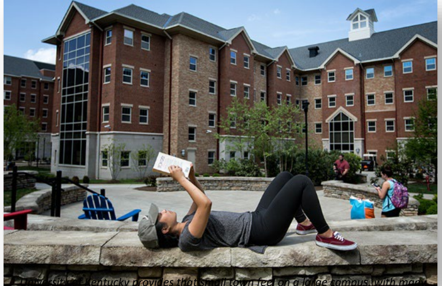
The University of Kentucky provides that small town feel on a large campus, with many new facilities designed to enhance your student experience.

UK boasts new, state-of-the-art dorms and dining halls , a recently renovated fitness center , and a brand new student center full of amenities . From heavily-discounted cultural opportunities available at the Blue Box Office , the Music and Fine Arts Center , drama and theater and lots more—you can't possibly be bored here at UK. Moreover, UK has over 500 student organizations that you can participate in...exploring opportunities with everything from fencing and ballroom dancing to mountain biking, astronomy, board games, bowling and billiards, robotics, running, Greek life, and plenty more.